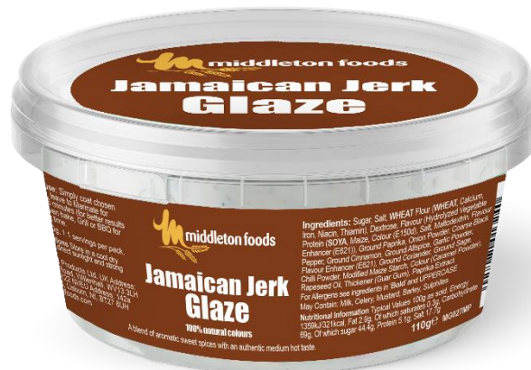
MINI POT EXAMPLE