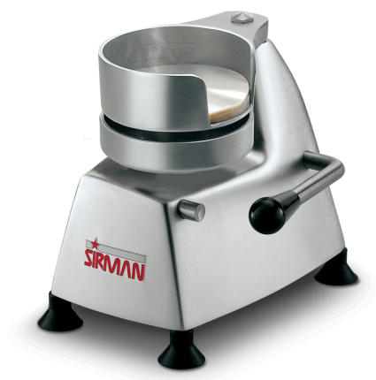
Sirman Hamburger Presses , model S.A. 100 :

Sirman Spa Viale dell'Industria 9/11 35010 PIEVE DI CURTAROLO (PD), Italy Tel./Fax. +39 049 9698666 / +39 049 9698688 email: info@sirman.com